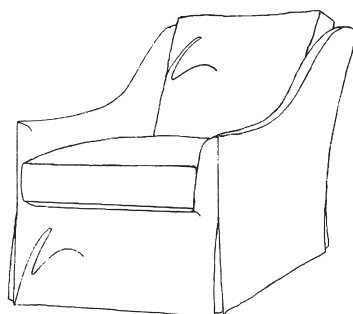
Shown with Waterfall skirt*