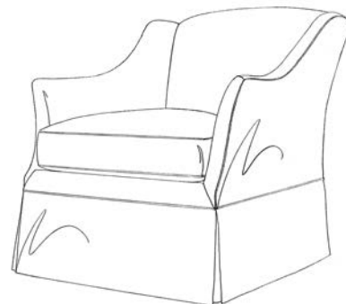
Shown with Dressmaker 10" skirt